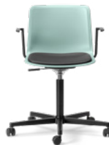
Ocean 100% Post-industrial recycled PP