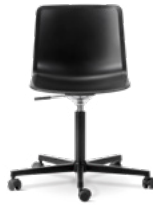
Black 30% Post-consumer recycled PP 70% Post-industrial recycled PP