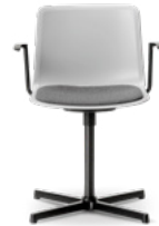
Stone 100% Post-industrial recycled PP