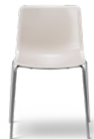
Sand 100% Post-industrial recycled PP