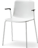
White 100% Post-industrial recycled PP