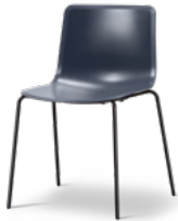
Dark Blue 100% Post-industrial recycled PP