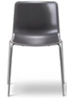
Dark Grey 100% Post-industrial recycled PP