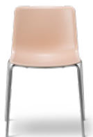
Powder Nude 100% Post-industrial recycled PP