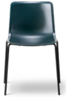
Ancient Green 100% Post-industrial recycled PP